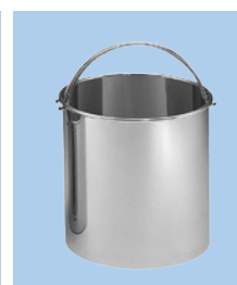
Stainless Steel Basket φ 390 × H285mm φ 390 × H375mm