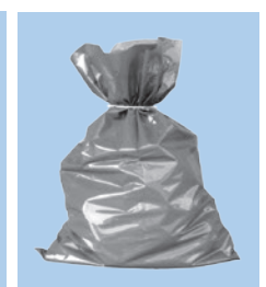
Wasting Bag A. 500 × 700mm (200pcs) B. 620 × 820mm (200pcs)

Specifications and appearance are subject to change without notice due to continuous product improvement.